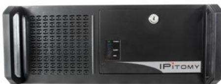
IP5000 - Pure IP PBX

Go to IPitomy.com for more details and a complete list of features.